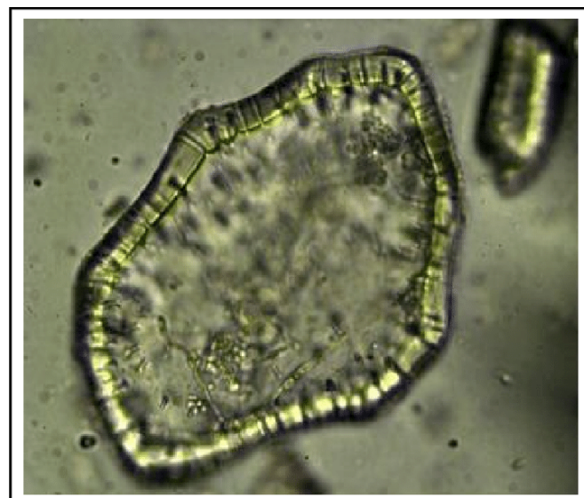
Figure 6 and 7: Microscopy of Triphala churna