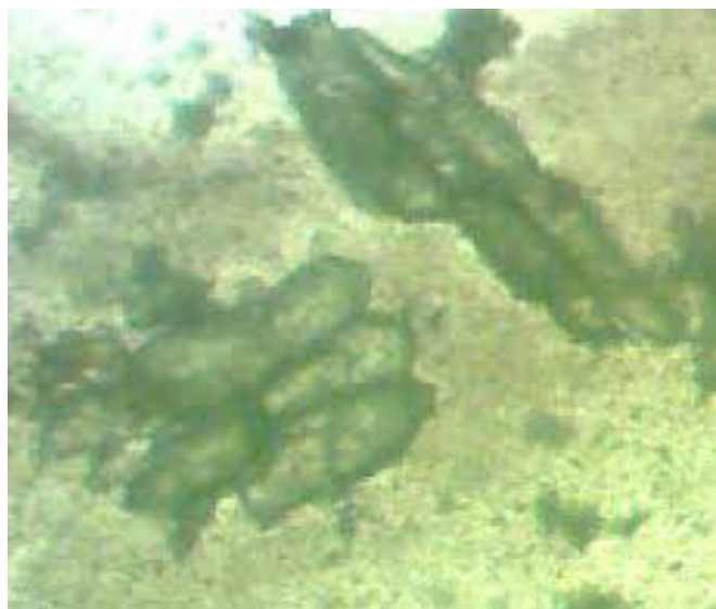
Figure 4 and 5: Formulated Preparation Marketed Preparation