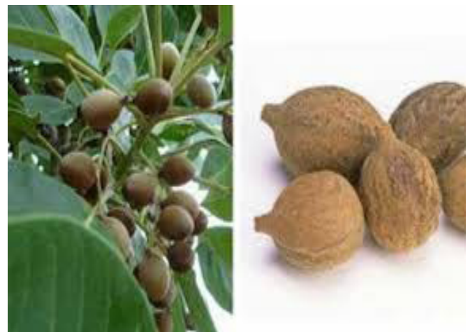
Figure 2: Bahera

Terminalia contains fixings that help animate the heart. It may likewise help the heart by bringing down cholesterol and circulatory strain.