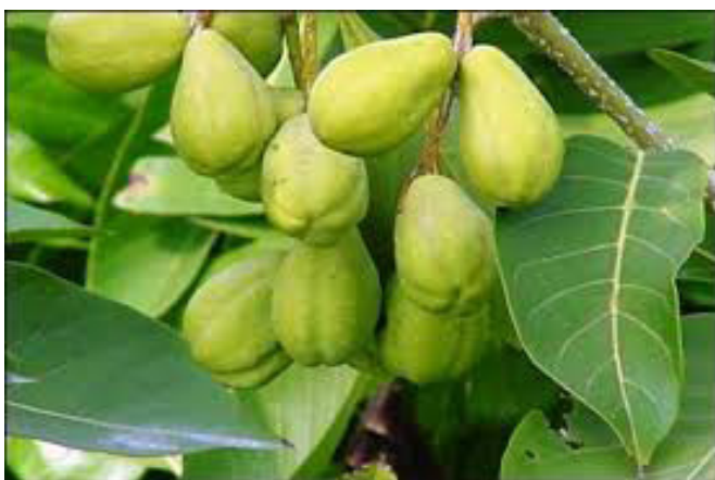
Figure 3: Harade plant