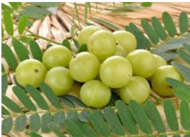
Figure 1: Amla

The recuperating and restorative properties of amla are countless as it is stacked with nutrient C, calcium, iron, phosphorous, carotene, nutrient B, protein, and fiber. Amla holds a ton of incredible strict noteworthiness during ceremonies in the Hindu month of Kartik, which generally falls in the middle of October and November. In numerous pieces of India, it is a training to offer the natural product as a Naivedya to Lord Shiva and eat it to avert different respiratory contaminations, basic cold, influenza, and other medical issues that are caused because of the lopsided characteristics of Vata, Kapha, and pitta. Amla is a powerhouse of cancer prevention agents,